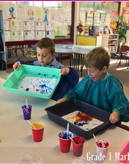
Grade 1 Marble Painting