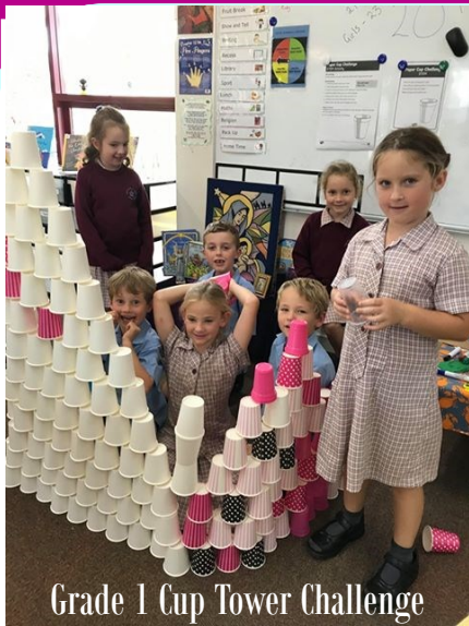
Grade 1 Cup Tower Challenge