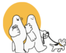
3. Encourage action