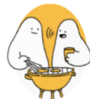
4. Check in